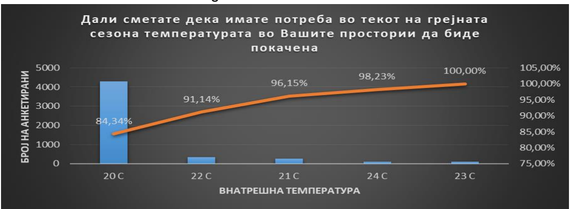
Figure 7 Overview of the need to increase the internal temperature

In order to increase the comfort in the warmed up space, the company conducted an inquiry into whether consumers of thermal energy would like to increase their temperature in their homes. The question contained in itself the information that increasing the temperature in the units of storage will increase the cost of the same, ie it will be reflected by increasing the monthly invoices for consumed heat. Inquiry survey was carried out regionally in the City of Skopje and in accordance with the obtained results it can be noticed that consumers are not interested in increasing the temperature at all if this means an increase in costs. It is reaffirmed that the price or the amount of the monthly invoice that the consumer receives plays a crucial role in the satisfaction of the consumer when using this service.