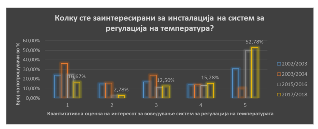
Figure 6. Interested in installing a temperature regulation system

In order to increase the comfort in the warmed up space, the company conducted an inquiry into whether consumers of thermal energy would like to increase their temperature in their homes. The question contained in itself the information that increasing the temperature in the units of storage will increase the cost of the same, ie it will be reflected by increasing the monthly invoices for consumed heat. Inquiry survey was carried out regionally in the City of Skopje and in accordance with the obtained results it can be noticed that consumers are not interested in increasing the temperature at all if this means an increase in costs. It is reaffirmed that the price or the amount of the monthly invoice that the consumer receives plays a crucial role in the satisfaction of the consumer when using this service.