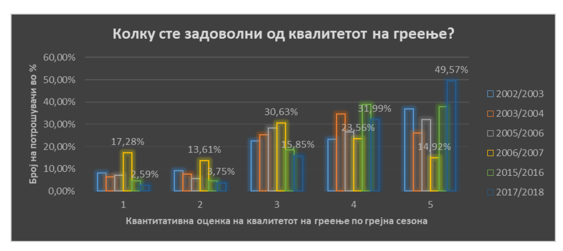
Figure 2 Satisfaction of consumers from the quality of heating

The first criterion for analysis is after the regional or territorial division of the entire district from the city to be heated. The company Thermal Energy Supplier in order to get closer to its customers with the intention of more efficient and effective resolution of common problems they encounter, has in its organizational structure three subsidiaries represented through toll centers named West, Center and East, and each of them serves a specific region or territory.