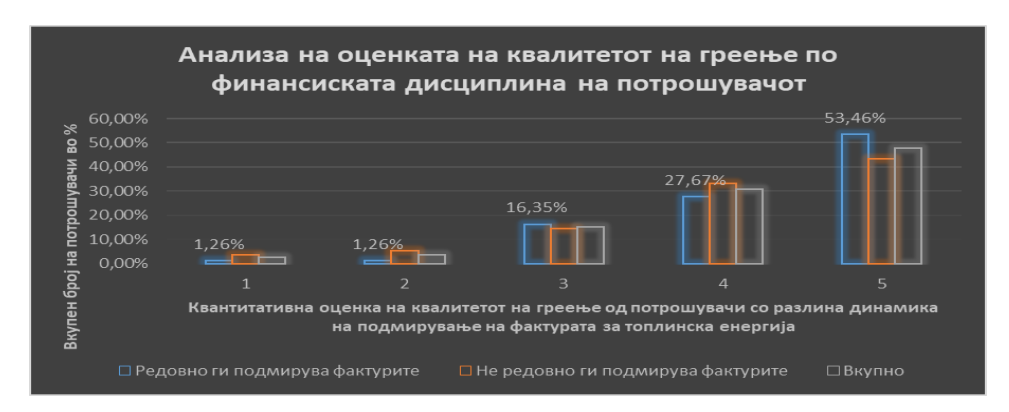
Figure 8. Assessment of the quality of heating in accordance with the financial discipline of the consumer.

For the quality of heating, financial discipline is not decisive, but crucial for customer satisfaction, because the quality / price ratio is decisive for an increased percentage of regular invoices, which in itself are evidence of consumer satisfaction.