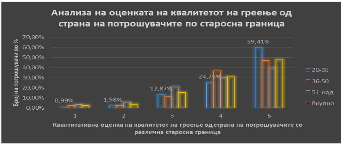
Figure 5 Evaluation of the quality of heating along the age limit of consumers

In the direct conversations with consumers from the same collective housing unit with the identical square of the housing object and the same orientation of the housing object, the difference is only in the category of consumers giving contradictory data on the quality of the service, ie one characterizes as the other one as the average. After checking all measurable flats for that measuring point, that is, for that collective residential object as well as by measuring the internal temperature in the premises of both residential buildings, it was found that the temperature in the apartments is within the legally prescribed temperature. This led me to conclude that the quality of the heating, the service, ie the comfort that the consumer wants to feel in the residential space is subjective, which directs to make an analysis of the answers to the question by gradation by age . The analysis of this criterion confirmed the thesis that the feeling of comfort and the necessary heat on the heating surfaces is a subjective feeling, depending on the extreme limit of the consumers, namely, the greater the dissatisfaction with the quality of the heating / service greater.