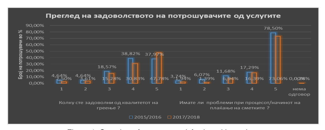
Figure 1. Overview of customer satisfaction with services

The company continuously improves the manner and availability of payment for invoices for consumed heat, using all modern technological information systems and applications. Consumers, after the possibility of paying invoices through a bank, a post office, offers the possibility to pay the invoices through their own website where the consumer can have insight into the invoices that are due for payment. Due to all the benefits and opportunities that the company offers in this field, showing respect for the private time of its consumers, they award it with a high 73,06% excellent rating.