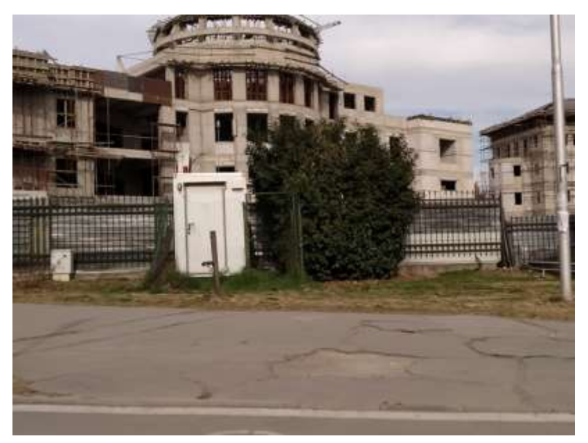
Figure 3 Automatic monitoring station – Rectorate

Automatic monitoring station in Rectorate was set up in 2005 and it is located near a major intersection in downtown Skopje. The urban station for measuring the impact from traffic represents the area with high impact of traffic emissions. At this station the following pollutants are measured: O_3 , NO_2 , CO, PM_{10} and BTX.