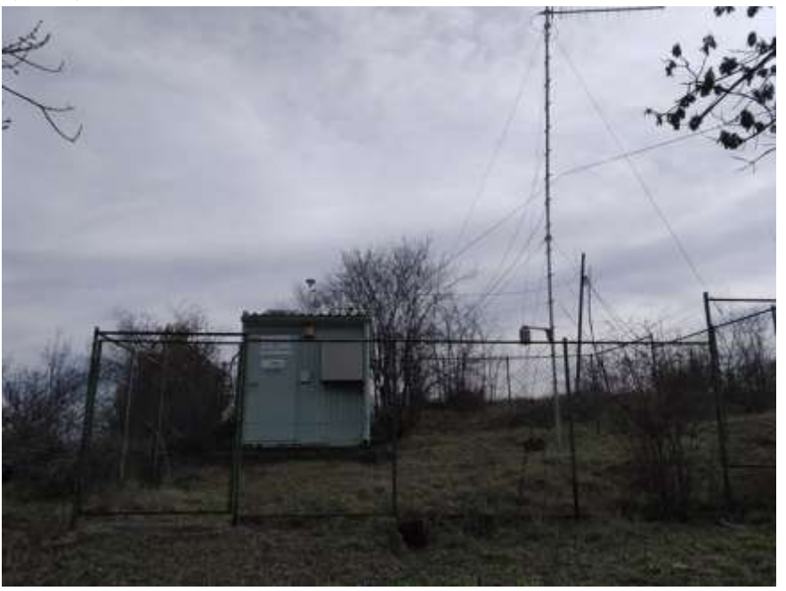
Figure 2 Automatic monitoring station – Gazi Baba

Automatic monitoring station in Gazi Baba was set up in April 1998 and it is located on a hill in the north-west part of Skopje, near the University Complex of the Faculty of Natural Sciences and Mathematics. There is a parking lot 20 meters away from the station. In the Zelezara area, north-west of the station, the metallurgical industry is located 2 km away from the station. The distance from the main road ("Alexander the Great" Boulevard) is 300 meters, while the nearest residential buildings are about 100 meters away. At this station the following pollutants are measured: NO_2 , SO_2 , CO and PM_{10} .