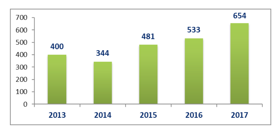
Figure 2. Number of operators involved in organic production (2013 – 2017)

Specifically, although in 2014 as compared to the previous year, the number of farmers, processors and traders with organic products decreased from 400 (2013) to 344 (2014), their number from 2015 shows an increasing trend, so the number of operators in 2015 is 481, 533 in 2016 and 654 in 2017.