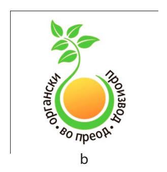
Figure 1. National label for organic product (a) and organic product in conversion (b).