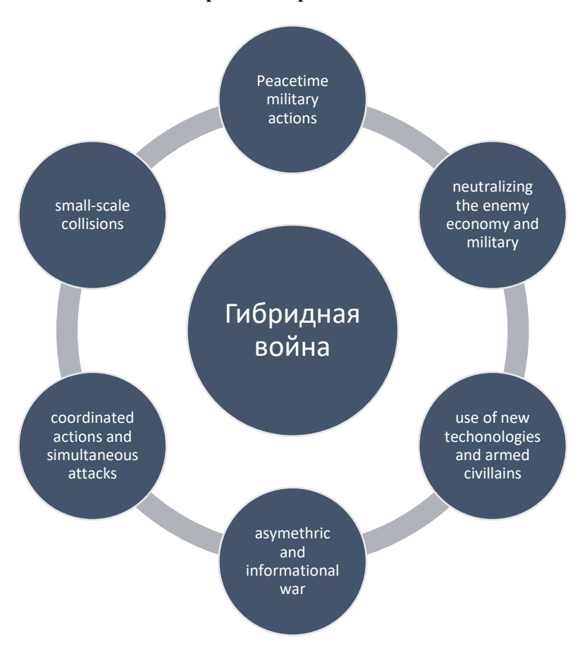
Figure 2. The Russian concept of "Гибридная война".

Finally, this article also launches its own definition about hybrid conflicts. They can be defined as fourth-generation non-strategic and asymmetric conflicts that combine conventional and unconventional methods, hard and soft power to shorten and prolong conflict to paralyze the opponent's decision-making process and its informational, economic, military and political elimination. This definition does not claim universal character. It is just a working explanation that helps the article to prove that hybrid conflicts are one of the most serious threats to international security today.