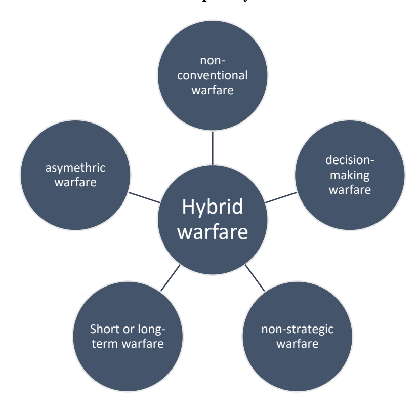
Figure 1. Matrix of the Western concept of hybrid warfare.