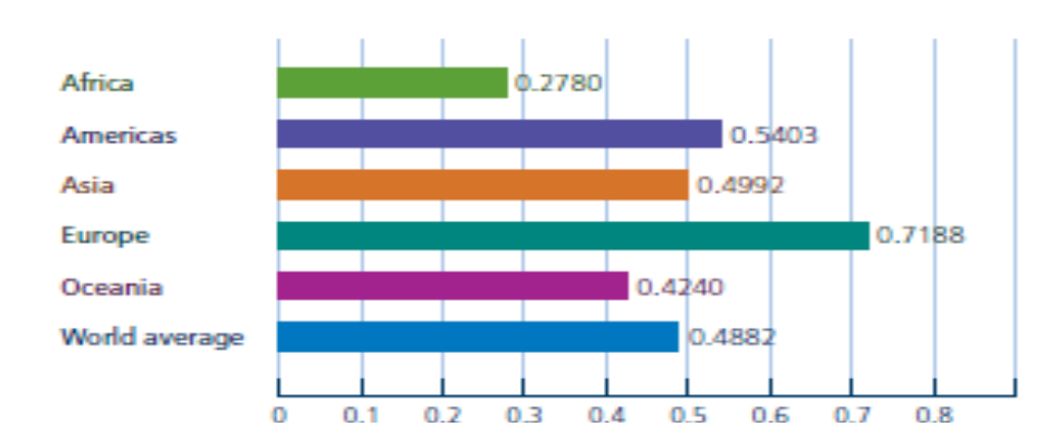
Figure 1. E-government development index within worldwide regions (2012)

Despite considerable strides towards bridging the digital divide, infrastructure and human capital limitations in several parts of the world impinge upon the ability of governments to spread – and the citizens to partake of – the benefits of information technology in the delivery of services. With a history of high levels of functional education and widespread telephone infrastructure, Europe and the Americas as a whole remain far ahead of the rest of the world regions. Asia, which is home to around three-fifths of the world citizens, has nevertheless only around 70 per cent of the level of e-government in Europe while the level of services in Africa barely squares off at 40 per cent of those in Europe.