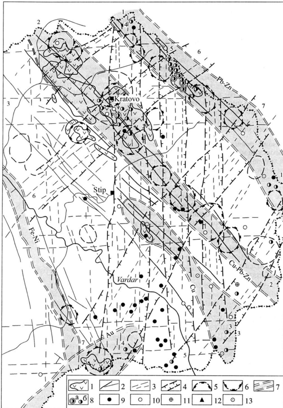
Fig. 4. Scheme of the Cenozoic metallogeny in the Eastern Macedonia