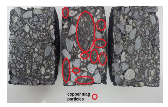
Fig. 3. Asphalt mix with slow air cooled copper slag aggregate (marked with red circles in the composite) (Raposeiras et al., 2016a).

rocks) if it was initially air cooled and then crushed, possessing high angularity, resistance to wear, high density and hydrophobic properties (Dhir et al., 2017) suitable for applications in asphalt pavements. Nevertheless, the usage of granulated copper slag has not been reported, mostly due to its vitreous nature and issues with cracking, fragileness and sharp surfaces, which are not favorable in pavement surfaces.