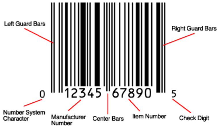
Figure 2. The product bar code for sale

A barcode is “A machine-readable code in the form of numbers and a pattern of parallel lines of varying widths, printed on and identifying a product.” Barcode systems help businesses and organizations track products, prices, and stock levels for centralized management in a computer software system allowing for incredible increases in productivity and efficiency. These can be interpreted using an optical reading device that captures the image, extracts the information, and converts it into useable data (i.e., unique identification number). It improves the speed and accuracy of reading labels and identifying items and reduces error rates.