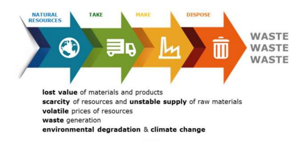
Figure 1 The main direction from a Linear economy