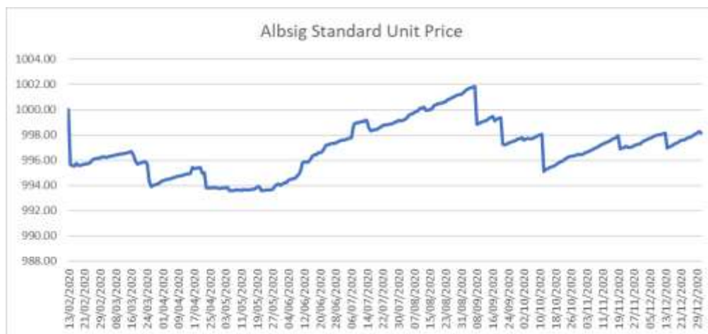
Figure 4 Performance data for AlbSig Standard [16]