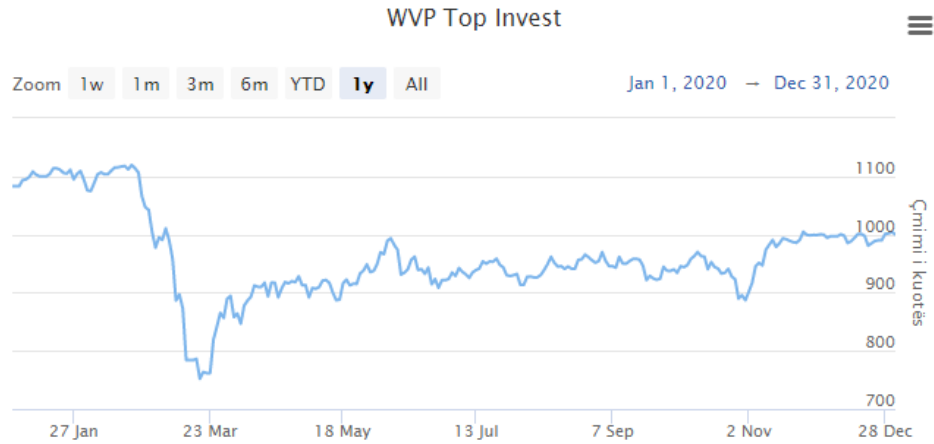
Figure 2 Performance data for WVP Top Invest [14]