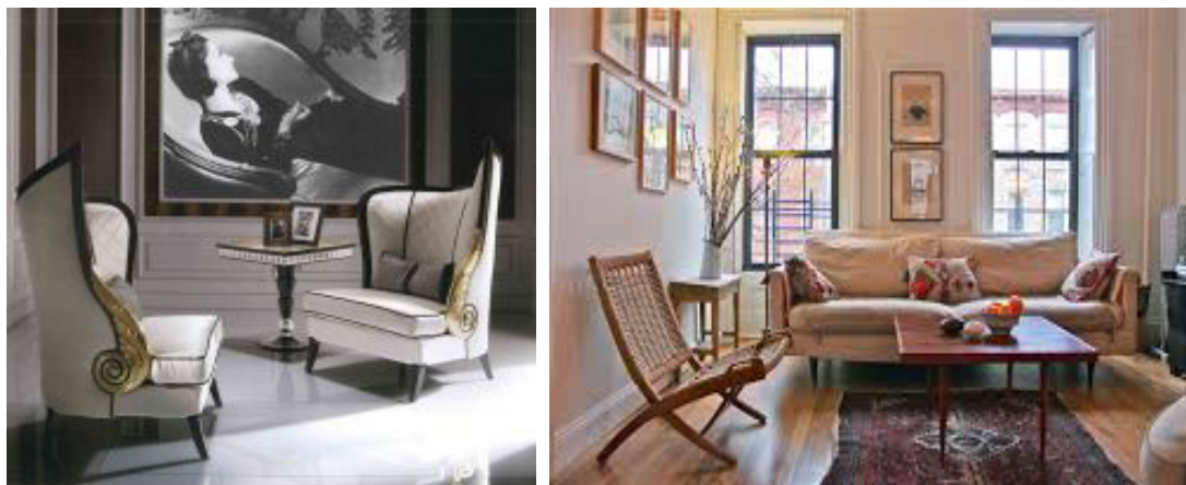
Figure 3.: Modern furniture eclectic