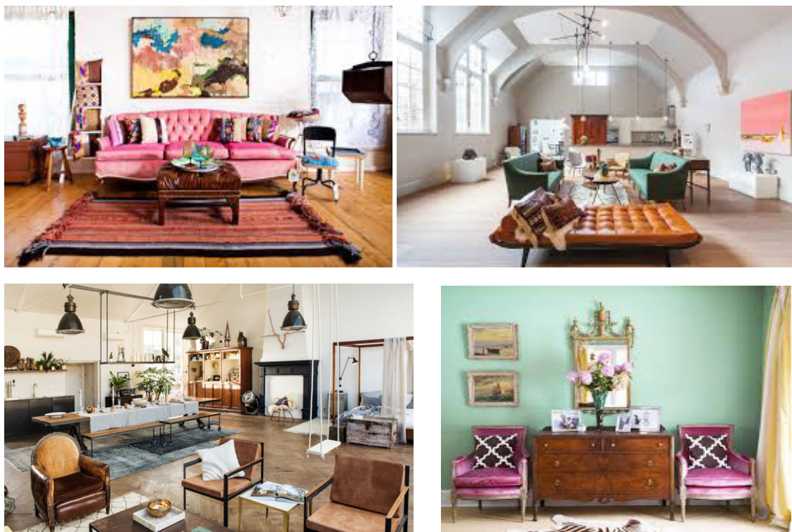
Figure 1.: Eclectic interior

This style is designed for people with a good taste for style, people who enjoy the interiors with objects from different cultures, people who are very passionate and people who can not overcome a single style. It often happens that interiors in eclectic style are interpreted as feminists, so the crazy retro color gamut and texture of space give them a touch of "femininity."