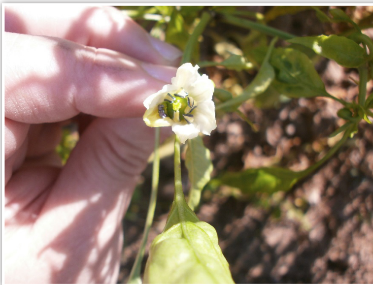
Figure 2. Pepper plants with distorted anthers and filaments of the flowers, and grown into one whole entity.

this study. In pepper plants, typical symptoms assessed in the leaves in the course of disease progress were yellowing, stunting and wilting. The fruits were smaller and without taste. The anthers and the filaments of the flowers were distorted and grown into one whole entity (Fig. 2). The roots of symptomatic plants were dry and/or not well developed (Fig 3).