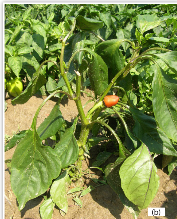
Figure 1. (a) Pepper field in the Strumica locality; (b) symptoms of stolbur phytoplasmas on a whole Capsicum annuum var. cerasiforme plant.