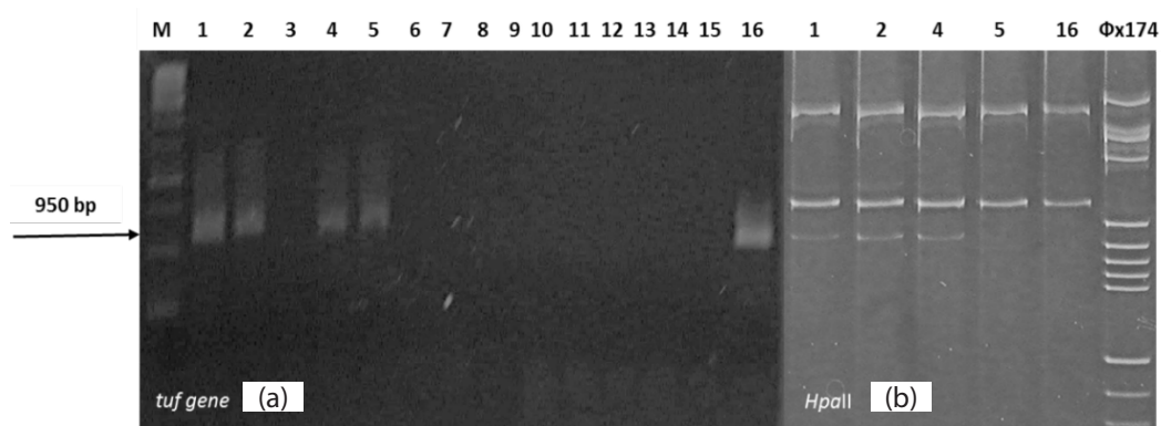
Figure 4. (a) PCR pattern of specific tuf gene for stolbur phytoplasma, including tomato and pepper plants: M – 1 kb DNA ladder marker; (1–7) pepper, Strumica, Burievo; (8) healthy pepper plant as negative control; (9) healthy tomato plant as negative control; (10–13) pepper, Strumica, Dobrejci; (14–16) pepper, Kocani, Cesinovo; (b) RFLP profiles from Hpa II digestions of positive fTufAY/rTufAY PCR products ( tuf gene) using 3% agarose gel: \Phi x174 – marker. b) RFLP profiles from Hpa II digestions of positive fTufAY/rTufAY PCR products ( tuf gene) using 3% agarose gel: \Phi x174 – marker.

Also, only PCR amplification was done to confirm vmp1 and stamp gene-positive profiles (Fig. 5).