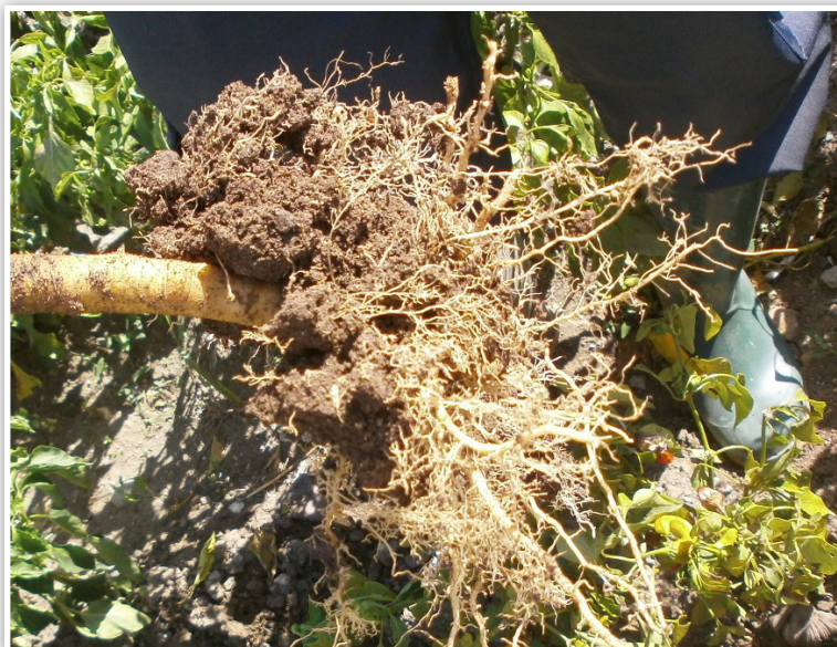
Figure 3. The roots of symptomatic plants were dry and/or not well developed.