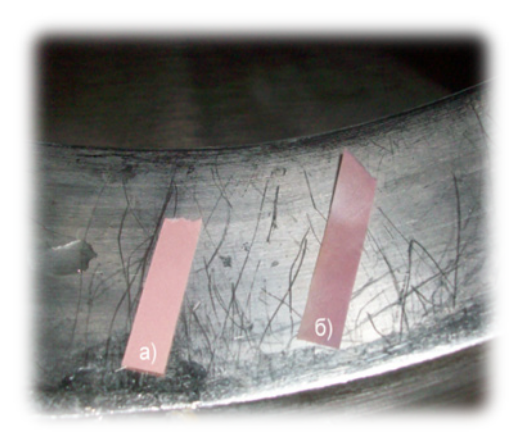
Figure 3. The litmus paper used to verify machine cleaning, (a) before (b) after the test.