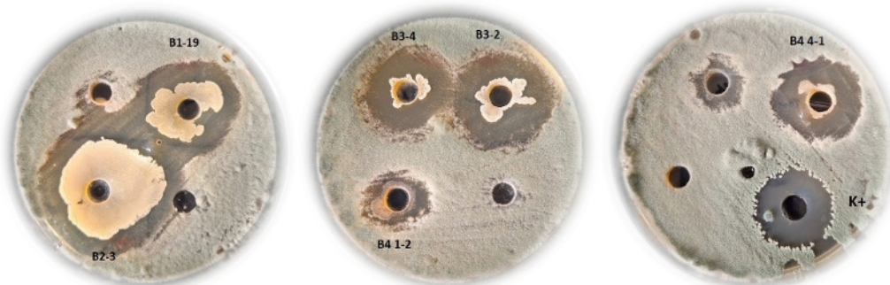
Figure 2. Well diffusion assay with Plasmopara viticola , with inhibition zones (20 – 32 mm) after 96 hours of incubation.

B 2-3 , B 3-2 , B 3-4 showed maximum inhibition of 20–32 mm, while only the extracellular extract of the isolate B 1-19 showed maximum inhibition of 25 mm against Plasmopara viticola (Figure 2).