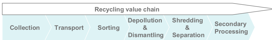
Figure 1. Recycling value chain

This chapter presents activities, material, and monetary flows involved in take-back and material recycling. Furthermore, the economics of the recycling value chain are analysed and put into a formalized structure, using activity-based costing as a method to allocate costs to products and services. Figure 1 shows the major steps of the recycling value chain that correspond to the constituents of the economic model.