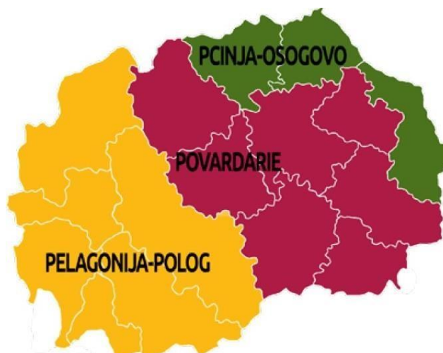
Figure 1. Wine regions in North Macedonia

There are three wine regions in the North Macedonia (Vlam & Simjanoska, 2011; Beleski, 2014; Robinson, 2015): Central Wine Region (Povardarie), Western Wine Region (Pelagonija-Polog) and Eastern Wine Region (Pcinja-Osogovo). These regions are divided into 16 winelands.