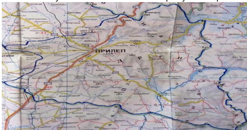
Figure 2. View of the road infrastructure in the municipality of Prilep

Below is the road and railway infrastructure in the municipality of Prilep.