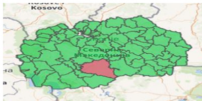
Figure 1. Geographical location of the municipality of Prilep within North Macedonia.

Čaška to the northwest and north, the municipality of Kavadarci to the east, the Sobota region in Greece to the southeast, and the municipalities of Novaci and Mogila to the southwest and west. The municipality of Prilep has a very favorable geographical position and transport connections.