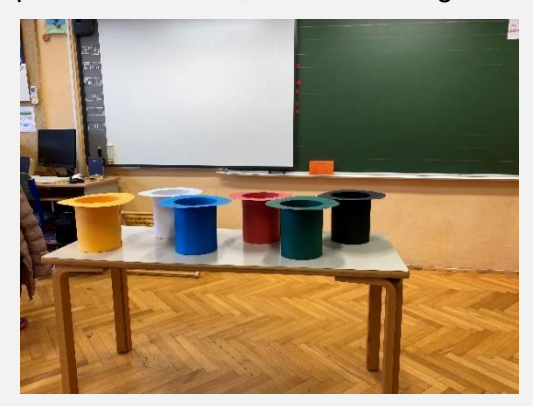
Figure 3: Arrangement of the hats during the workshop

Pupils also like to do the workshop in pairs, during which the pupils decide under which hat they will start thinking and go together to the placed hats, which have slips of paper with questions or tasks, as shown in figures 3 and 4.