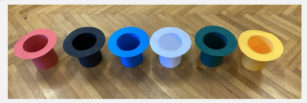
Figure 2: Placing the hats at a group workshop The pupils interpret a fairy tale by putting on a hat and thinking under the hat, then taking it off and passing it to another pupil who continues thinking.

The six thinking hats workshop is most frequently carried out in a group. After reading a fairy tale, pupils sit down and form a circle, in the middle of which I place the hats as shown in Figure 2.