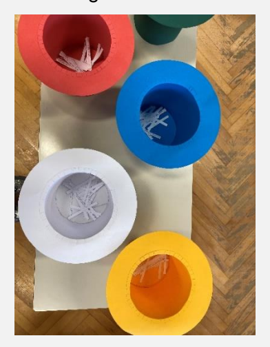
Figure 4: Displaying hats with slips